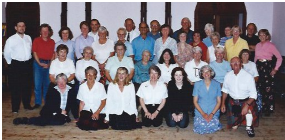
Some well kent faces from 2002

Feel free to come along any Wednesday evening at 7.30pm or speak to Janet Hope – (01475 520316)